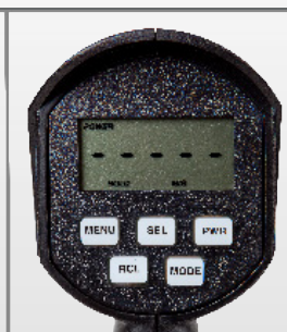
SVR™ Control Surface

Serving Law Enforcement for Over 60 Years