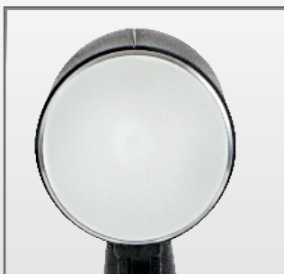
SVR™ Front View