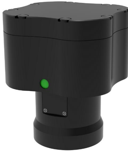
RD-306 Integrated Radar Water Level Gauge